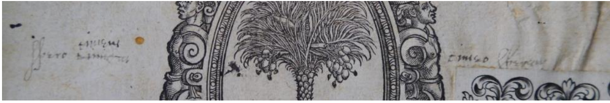
Jesus College Fellows' Library M.12.2 title-page